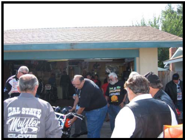
Big Al starting the mighty Kawi Z-1 900