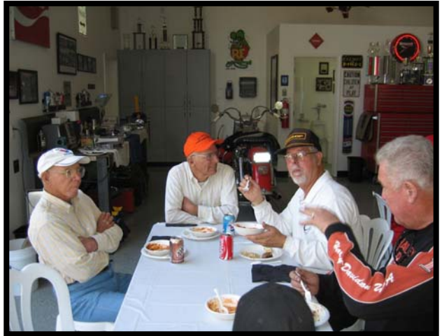
The boys, full and happy