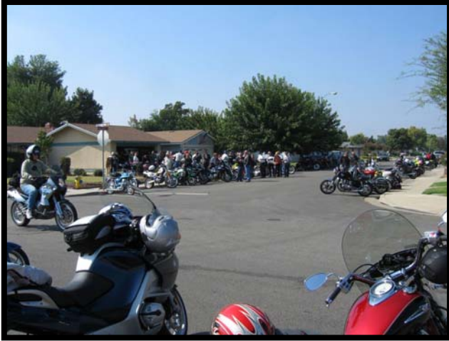
Big Al's place from the street