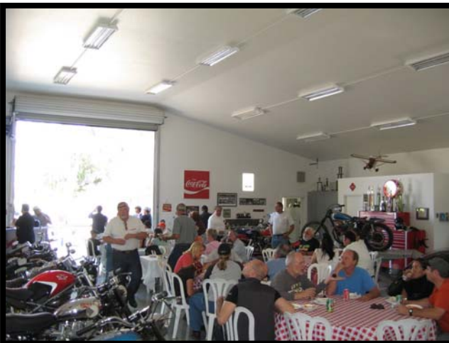
Bruce's shop. A great place to eat.