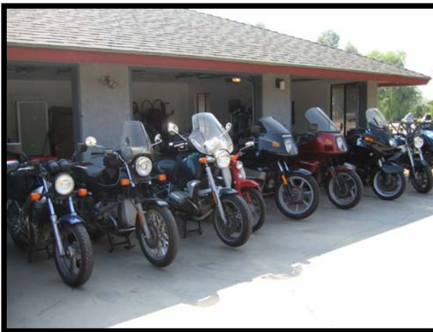
Larry Koop's Stable