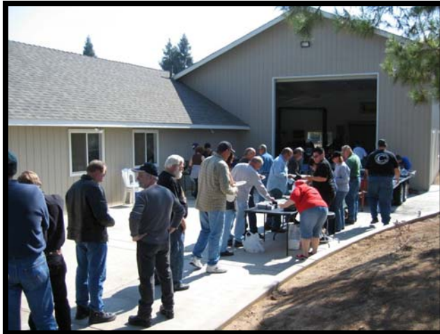
BBQ chow line at Bruce's