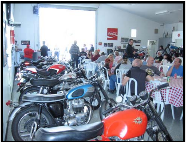
Live to Ride, Ride to Eat